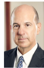
David Kappos Cravath